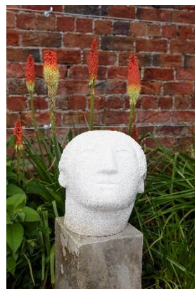
Some sculptures from previous years of ForM Sculpture Exhibition.