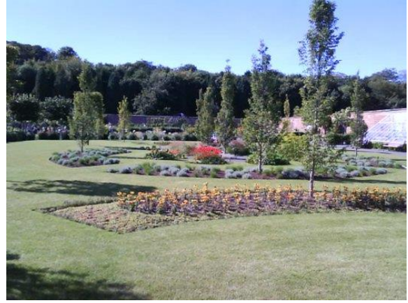
Some images of the Walled Garden