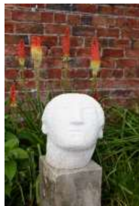
Some sculptures from previous years of ForM Sculpture Exhibition.